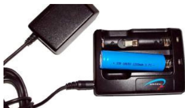
Battery Charger Part # UVT-BC