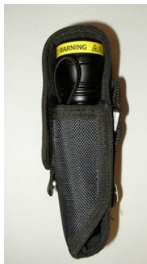
Carry Pouch Part # UVT-Pouch