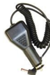
Car Charger Part # UVT-CC